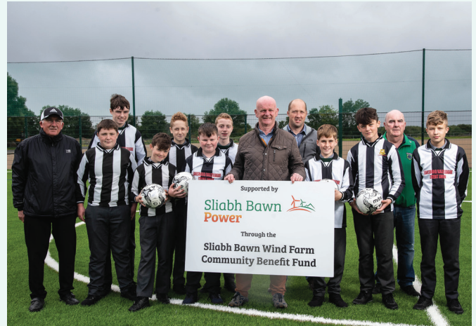
A Community Benefit Fund supports local clubs

For the residents around Knockshanvo and the adjacent hinterland, these funds will offer huge opportunities for strategic projects such as building local community facilities, deep retrofit schemes for homes or tourism upgrades and attractions. The scope for a community vision backed by reliable funding can help make rural regeneration a reality.