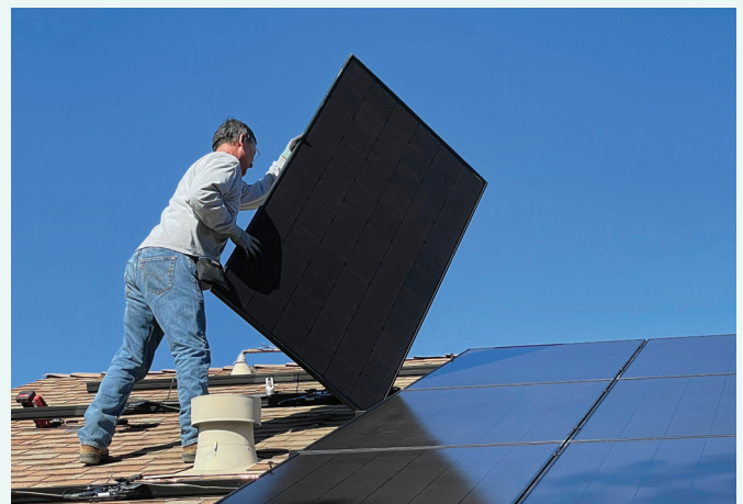
Home retrofit schemes fall under the remit