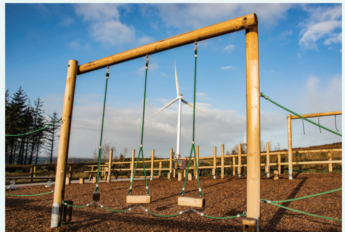
The Fund could help to build a playground